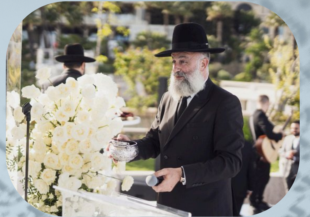
TSADIK RABBI ELIYAOU ABEH'SSERA