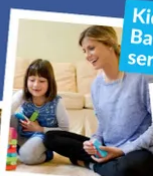
Kids'camp & Babysitting service