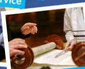
Prayer services Sephardic & Ashkenazi Rabbis and Cantors

Luxury at its finest - this Passover, make it special!