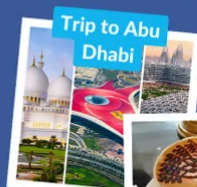
Trip to Abu Dhabi