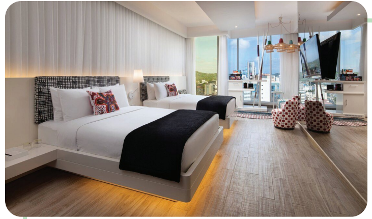
WONDERFUL Size: 398 sqft/452 sqft - 2 Queen Size or King Size Bed